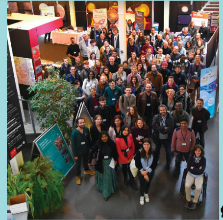
1 st edition, Oct 2023